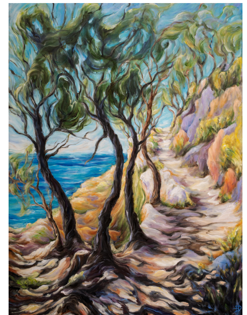
The Ascent Oil on Canvas 2024 80x60cm