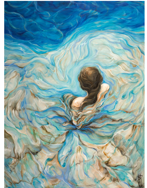
Mediterranean Flower Oil on Canvas 2024 80x60cm