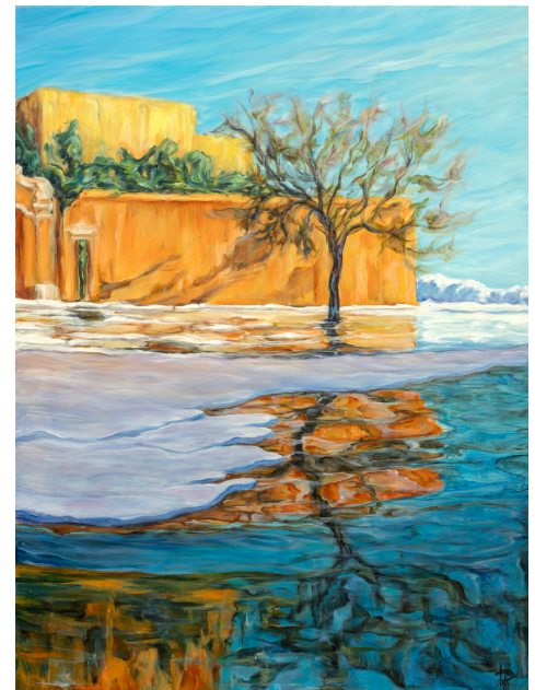
Mirror the Unknown Oil on Canvas 2024 80x60cm